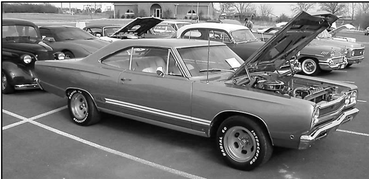
The Valentines gathering in Vilonia was all about being with our loved ones. Yep, you got it, our cars. Oh yeah, wives, husbands significant others were welcome as well <grin>.