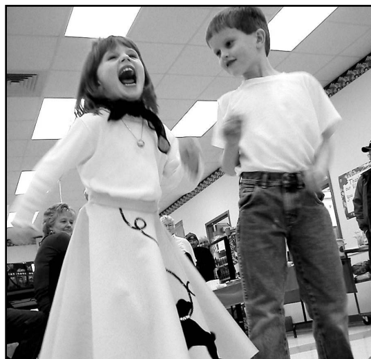
The children had a great time during the twist competition.

Several APA members made the trip to Vilonia on February 8th for the Vilonia Vintage Car Club's Valentines Day bash.