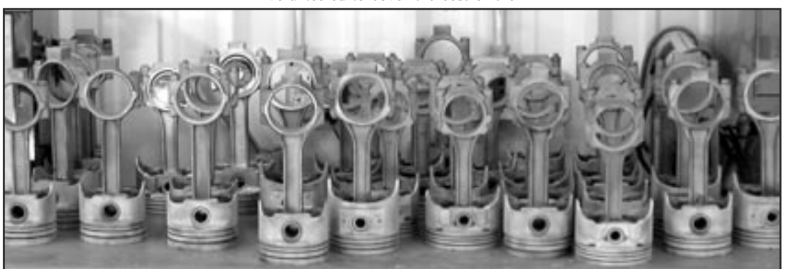
Sandblasted rod/piston combos line the bench at BPR, waiting to be painted.

Ritter reported that there was no change in plans for the Poncho Power Tour in November.