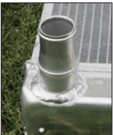
3 - The top radiator hose is stepped for 1.25 or 1.5 inch hose inlets. The 1.5 was needed for this application.