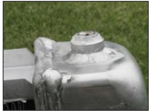
5 - The solution was a flush fit hex plug like you'd use in an intake manifold. Be sure to use thread sealer. You don't want leaks.