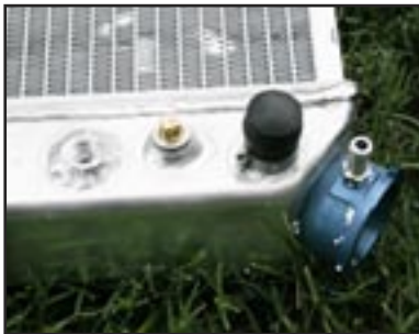
2 - Close examination of the new unit shows a few extra fittings that our stocker did not have. One allows the use of an extra sensor for electric fans. The black cap covers another hose opening used by GM trucks.