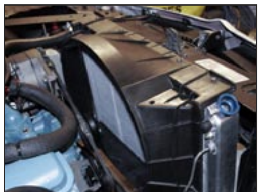
7 - Other than trimming a small section of the shroud next to the petcock to allow it to turn, it was a drop in fit.