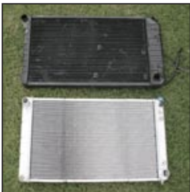
1 - The physical dimensions of the new aluminum radiator were virtually identical to the old copper/brass radiator.