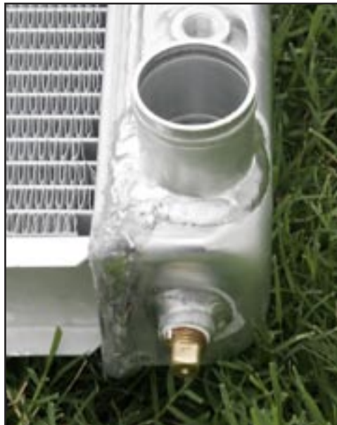
4 - The only problem was this generic, square pipe plug that came with the unit. It won't clear the core support.